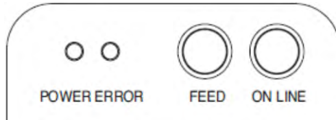
Figure 1: Control panel

The control panel has two indicator LEDs and two buttons.