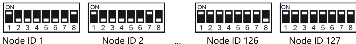
Figure 1: Switch positions - Node IDs

The subscriber address (node ID) is configured using the coding switch and must be done prior to commissioning. The value of the address to be configured is determined by the petrol station controller and must be clarified with the manufacturer of the petrol station controller or with the responsible service company. The switch positions for the individual addresses can be found in the following illustration: