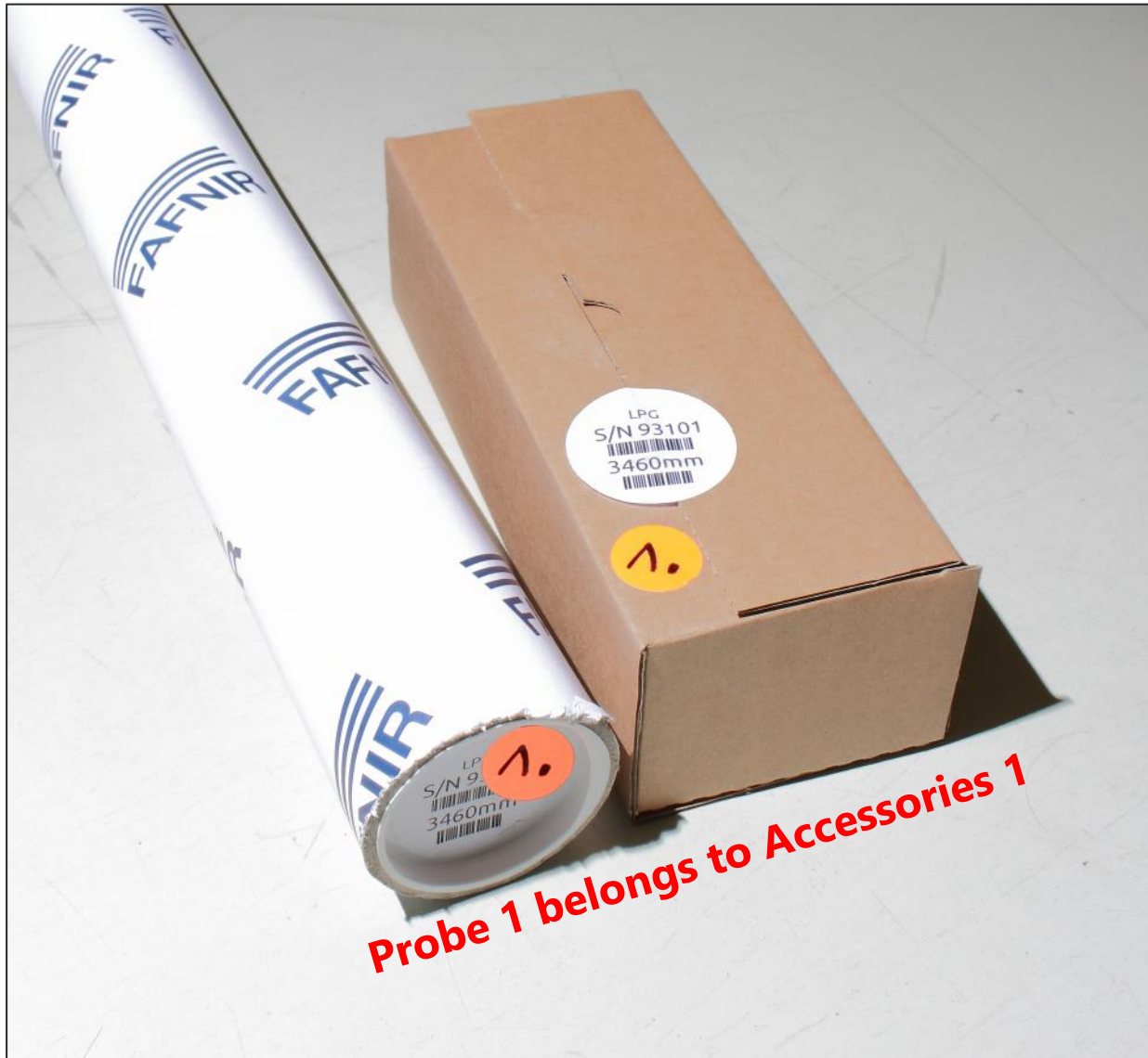
Figure 1: Scope of delivery: probe and accessories

Edition: 2020-05 Version: 2 Art. No.: 350209