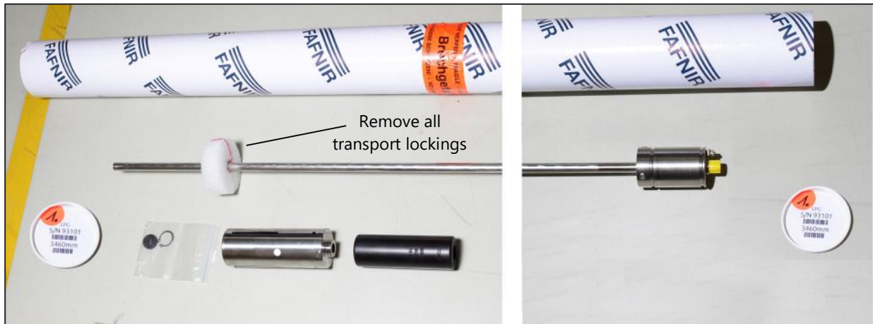
Figure 4: Accessories position