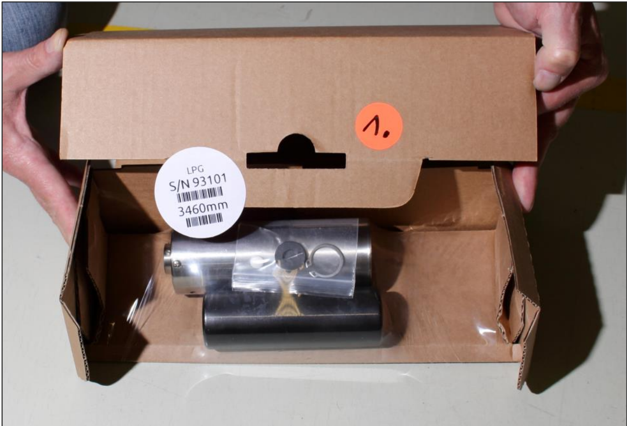
Figure 2: Accessories (optional)