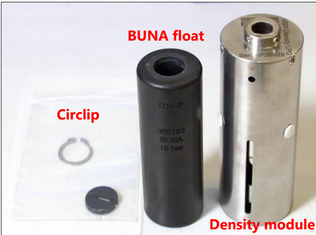
Figure 3: Accessories details (optional)