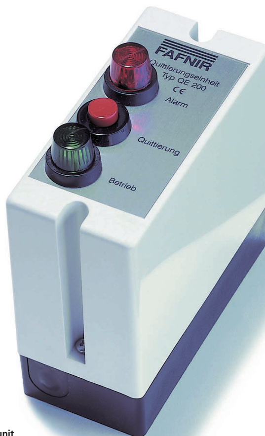
Acknowledgement unit type QE 200