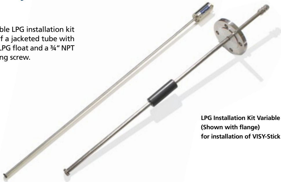
LPG Installation Kit Variable (Shown with flange) for installation of VISY-Stick LPG

The variable LPG installation kit consists of a jacketed tube with a special LPG float and a 3/4" NPT cutting ring screw.