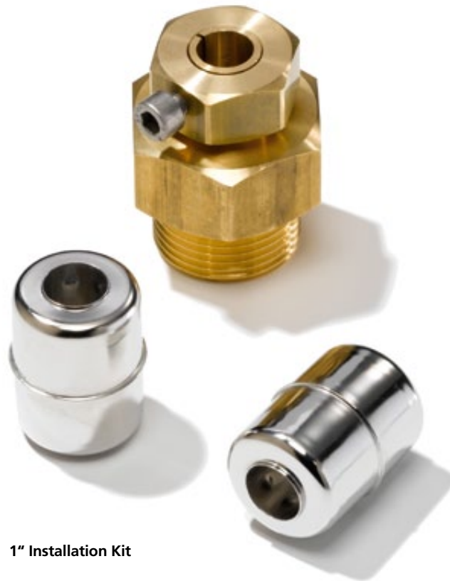
1" Installation Kit

The optional installation kit comprises a product float, a water float and a screw-in unit. It makes it possible to install a VISY-Stick using an R1 threaded coupler. The screw-in unit is also available in stainless steel.